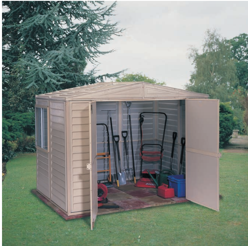
'The DuraMate' – 8' at front x 5' 3" at sides. Also available in 8' x 7' 10" Picture illustrates the optional window kit available for most sizes