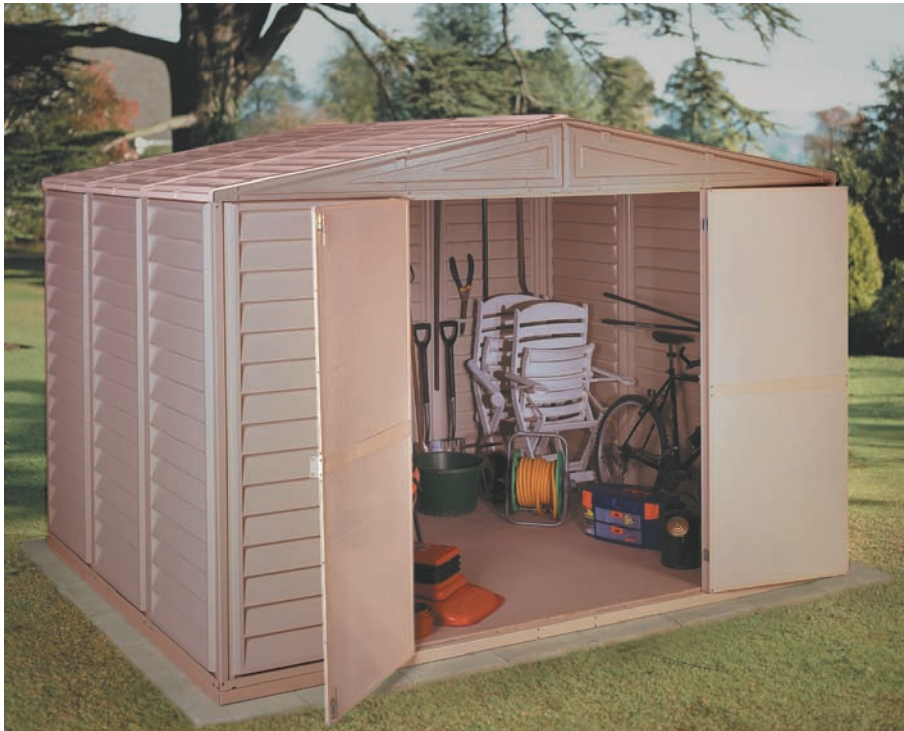
'The WoodBridge' – 10' at front x 8' at sides, also available in 10' x 10' and 10' x 13'