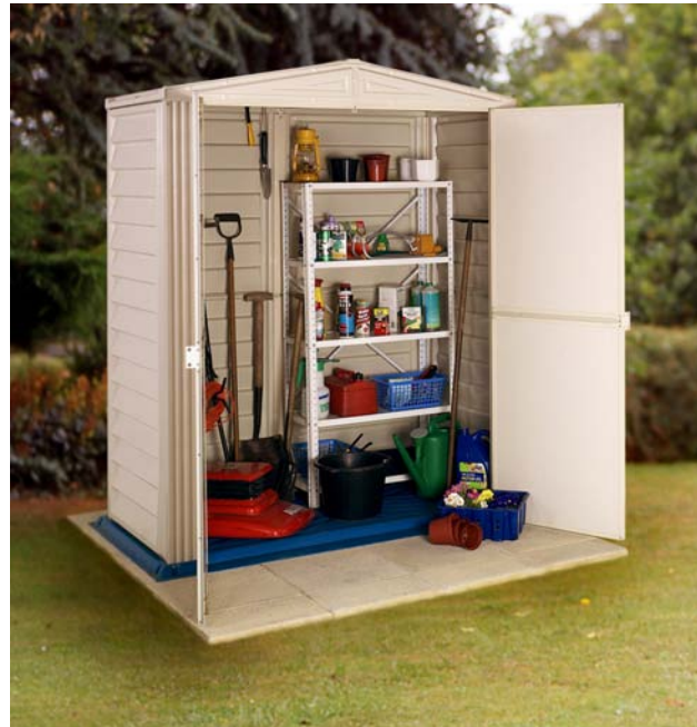
'The Little Hut' – 5' 3" at front x 2' 9" at sides. Also available is 'The Large hut' - 5' 3" x 5' 3" i.e. the same frontage, but twice the depth of 'The Little Hut'. Both models feature a strong, moulded integral floor in which the walls sit.