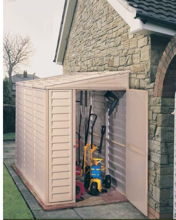
'The SideMate' – 4' at front x 7' 10" at sides