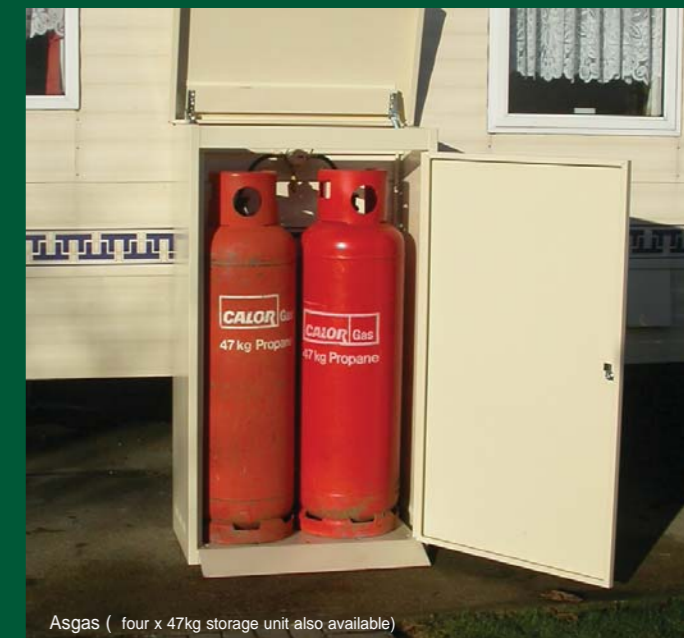
Asgas ( four x 47kg storage unit also available)

Lockable door \text{\textcircled{D}} universal lock to enable entry to gas supplier.