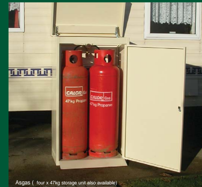
Asgas (four x 47kg storage unit also available)

Lockable door for universal lock to enable entry to gas supplier.