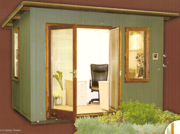
Shown in Deep Green