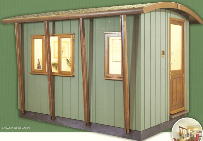
Shown in Deep Green