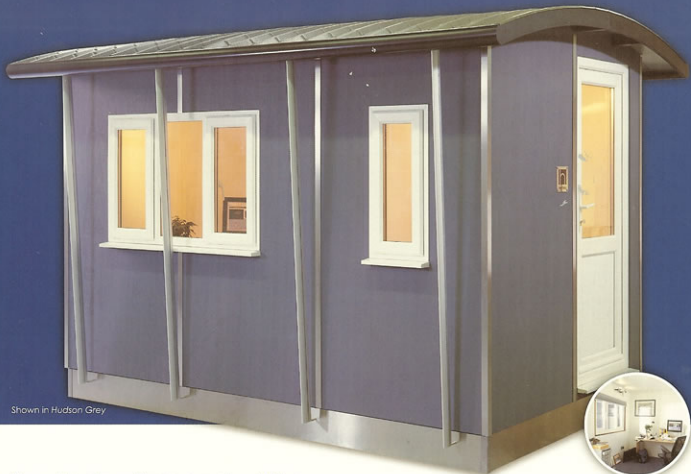
Shown in Hudson Grey