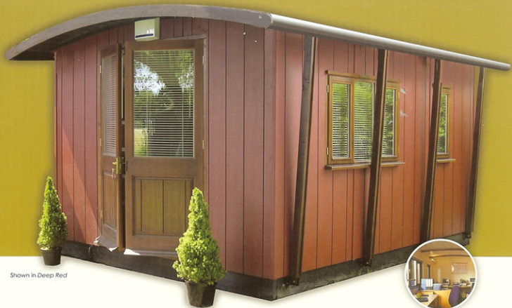
Shown in Deep Red