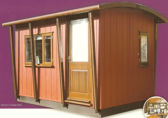
Shown in Deep Red