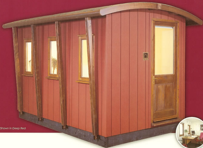
Shown in Deep Red