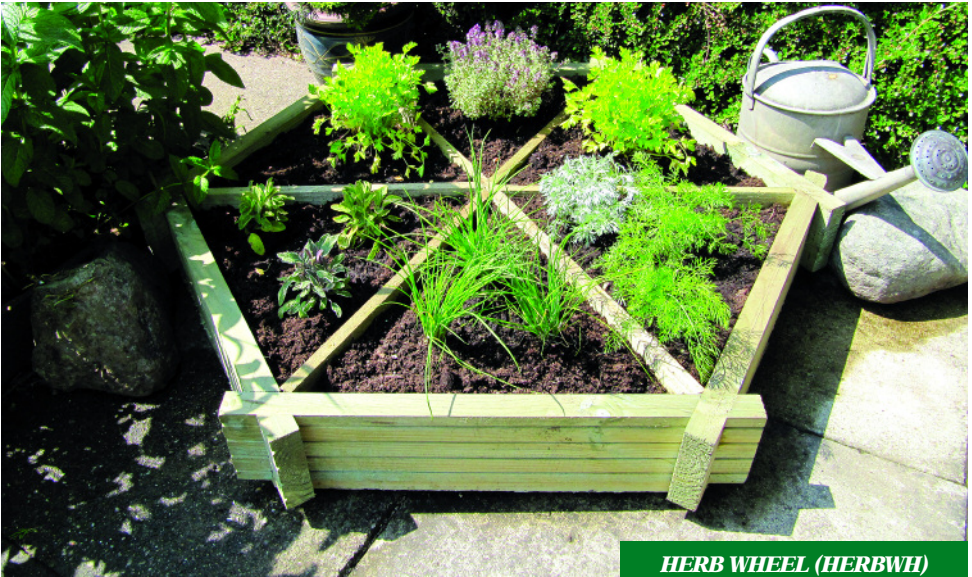
HERB WHEEL (HERBWH)