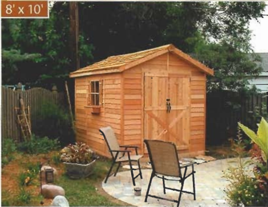
8' x 10' rancher at left built by Mike Cloud of Lombard, Illinois

The Rancher comes standard with a non-functional window with shutters and window box.